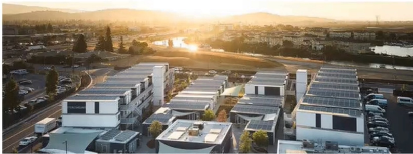
The accommodations at the $57 million San Mateo County Navigation Center in Redwood City resemble Modernist low-rise apartment buildings. The complex has 240 units.

Prefabricated modular campuses in Northern California are offering comforts that may help keep people off the streets—with pets, possessions and private space in mind.